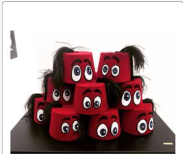
Mouna Tebeiz was supporting a charity called "Innocence in Danger" where various influential names from the world of art, fashion and design reinvented the Tarbouche in their own style. For example, this is a Tarbouche from Elie Saab. #art#saatchi#london#exhibition #tarbouche#auction#charity @mouna_rebeiz @eliesaabworld