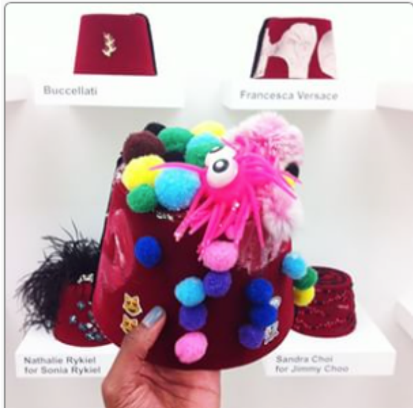
Shooting @saatchi_gallery today for @savoirflair and spotting some familiar names for @mouna_rebeiz's Tarbouche Project - @bipling 🎩👑